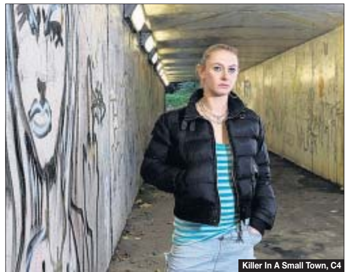
Killer In A Small Town, C4