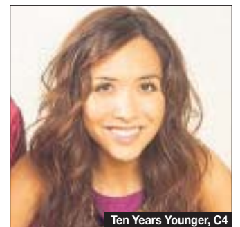
Ten Years Younger, C4

I'm not proud to admit it but I rather missed the condescending edge of Ms Hambleton-Jones. Once you'd heard Myleene squeal 'wow, you've got a great figure' for the umpteenth time,